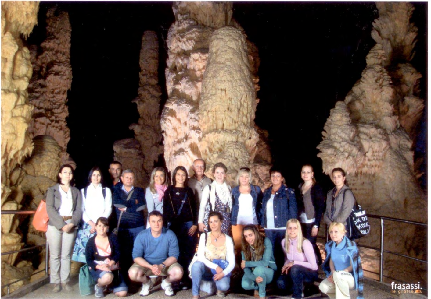
At the frasassi dripstone caves