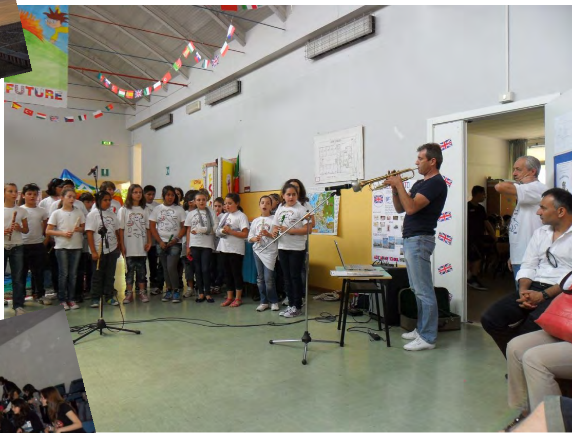
The pupils of the local music school gave a music performance to greet us.