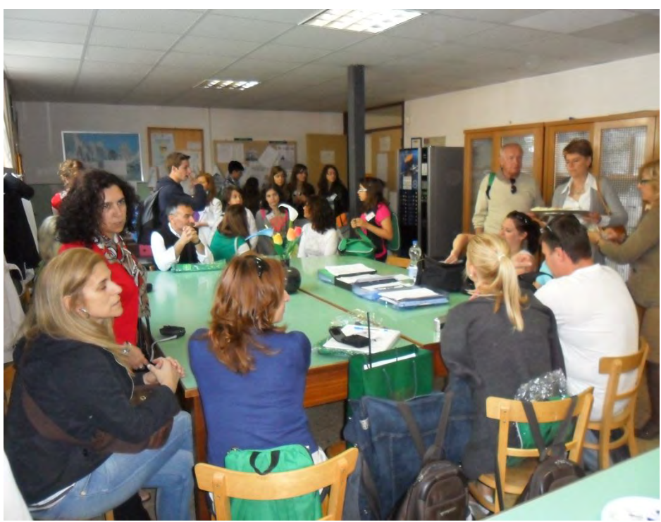
We spoke about further tasks on this meeting.